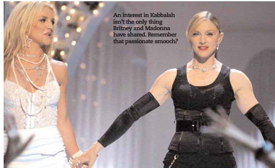
An interest in Kabbalah isn't the only thing Britney and Madonna have shared. Remember that passionate smooch?

Even though Britney and Kevin were married in a nondenominational Christian ceremony, she has been vocal about her interest in different world religions, including the Jewish mystical study of Kabbalah, which she was introduced to by her friend and mentor, Madonna. A source says Britney is very serious about her spirituality, and has even worn a red string on her wrist (it's said to deflect envious stares and evil intent) and donated $32,000 to the Kabbalah Centre. After her wedding ceremony, Britney gave her bridesmaids custom-made Bolsa bags bearing the Kabbalah word in Hebrew that means "the power to heal." "Britney is searching for a way to cope with all the pressures of her life," says the insider. "Having spiritual guidance helps her to see the big picture and count all her blessings, which, of course, she does."