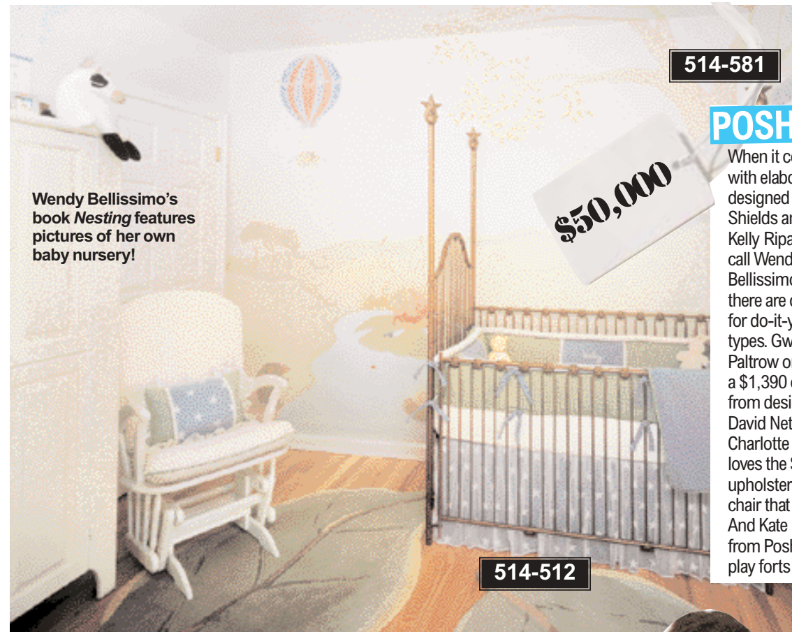
Wendy Bellissimo's book Nesting features pictures of her own baby nursery!