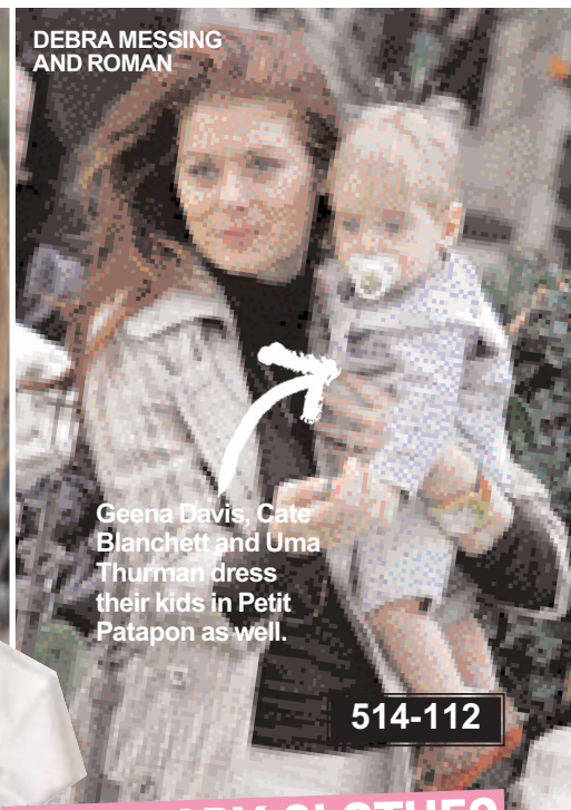
DEBRA MESSING AND ROMAN

Geena Davis, Cate Blanchett and Uma Thurman dress their kids in Petit Patapon as well.