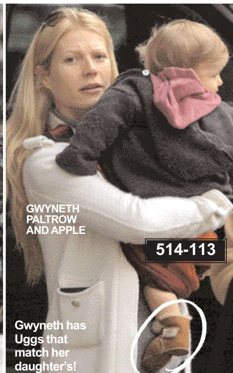
GWYNETH PALTROW AND APPLE