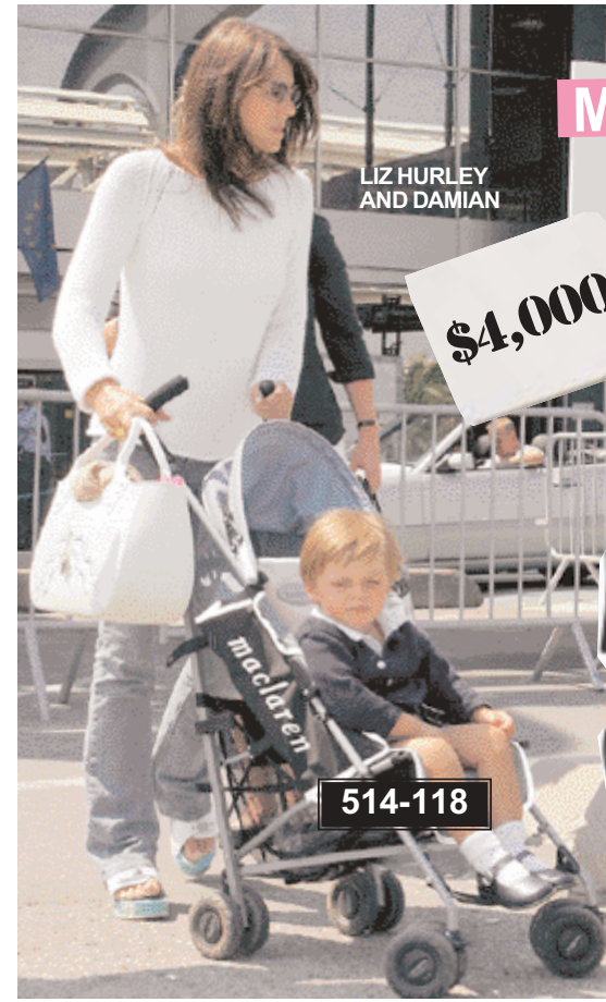
LIZ HURLEY AND DAMIAN

Ellen DeGeneres gave Gwyneth a Silver Cross pram!