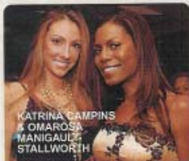
KATRINA CAMPINS & OMAROSA MANIGAULT STALLWORTH

Waiters and waitresses: If Mariah Carey sits at your table, you're in luck. The songbird tipped $2,000 — on a $2,000 bill — at New York's Kiltichai restaurant. Maybe she was trying to impress her companions — Usher and Naomi Campbell!