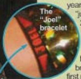
The "Joel" bracelet

Is Hilary Duff wearing her heart on her sleeve? Or, more specifically, on her wrist? Although the 17-year-old says she's "just friends" with 25-year-old Good Charlotte singer Joel Madden, she's been wearing a bracelet with his first name! For his part, Joel has said he's only hung out with Hilary a few times and hasn't even kissed her, but he joked on The Howard Stern Show that he'll wait until she's 18. For the record, he's got 11 months to go.