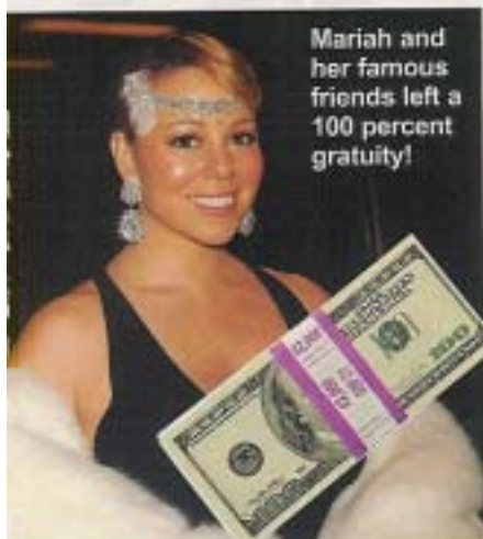
Mariah and her famous friends left a 100 percent gratuity!