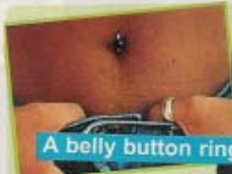
A belly button ring!

Sassy Apprentice castoff Katrina Campins told In Touch that she's decided on a Halloween costume: She's going as Omarosa! When her arch rival heard about Kat's plans, Omarosa shared some advice: "You'll need bigger boobs," she said.