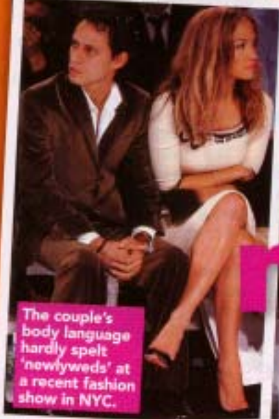
The couple's body language hardly spelt 'newlyweds' at a recent fashion show in NYC.