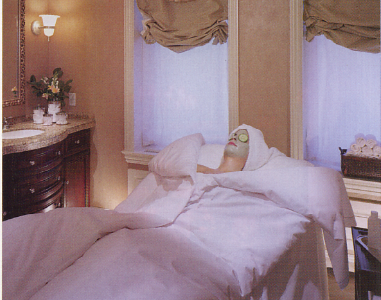
Willow Stream Spa Treatment Room

The Willow Stream Body Experience For Health (90 minutes, $229 Canadian) uses medicinal mud, healing waters and light massage for both a detoxifying and relaxing effect. It begins with a body wrap, which combines the famous cleansing and renewing effect of moor mud, with the uplifting aroma of fresh rosemary. It continues