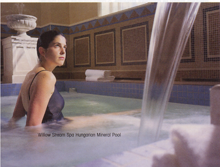
Willow Stream Spa Hungarian Mineral Pool

To ease the aches and pains of everyday life, Willow Stream offers all of the traditional massages. Our favorite is the Swedish Massage (60 minutes, $119 Canadian), a massage technique using long smooth strokes to relax muscles and stimulate the lymphatic and circulatory systems. But there is also the Aromatherapy Massage (60 minutes, $129 Canadian), Sports Massage (60 minutes, $129 Canadian) and Shiatsu (60 minutes, $119 Canadian), the 5,000-year-old Japanese technique, great if you have muscles, headaches, tension and insomnia. This treatment may be performed with comfortable loose clothing.