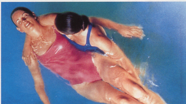
Float your wrinkles away at Mii Amo.

Relaxing at a spa usually means spending lots of time with your eyes closed, concentrating on the fingers that are loosening every knot in your over-stressed shoulders. However in Sedona, Arizona, you'll want to keep your eyes open every minute or you'll miss out on some spectacular views.