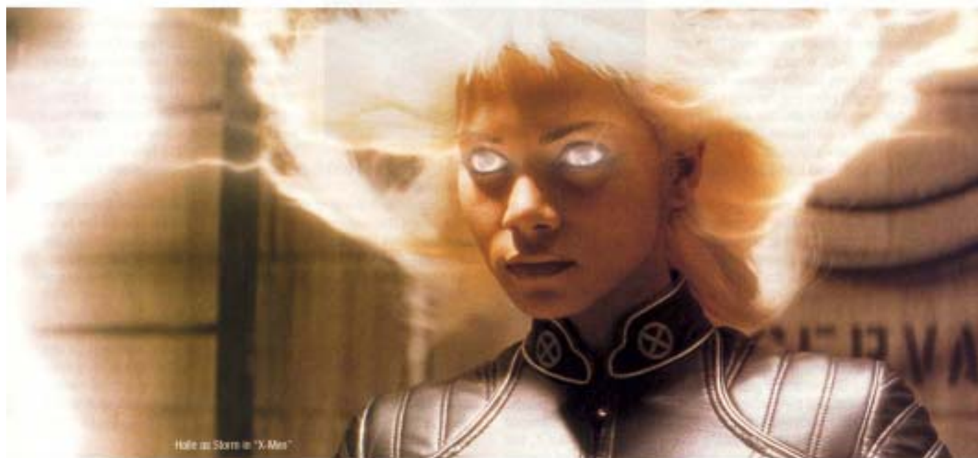
Halle as Storm in "X-Men"

When Halle Berry held her Best Actress Oscar at the 74th Academy Awards last March for her role in Monster's Ball , she knew she was in the midst of a history making moment. "What it means to other women of color is just as important as what it means to me," she said. "It means we are finding that new day that Dorothy Dandridge never got to see."