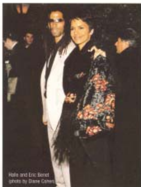
Halle and Eric Benet

And despite racism in school, Halle, the overachiever, still managed to become class president and editor of her school newspaper. As Miss Ohio, she was runner-up in the 1986 Miss USA pageant and was the first African-American to represent her coun-